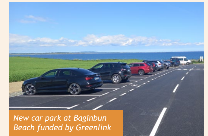
New car park at Baginbun Beach funded by Greenlink

We are pleased to say that the new car park at Baginbun Beach is now complete (see photo). We will also be providing new street lights and footpaths in the village of Ramsgrange, which is located along the cable route.