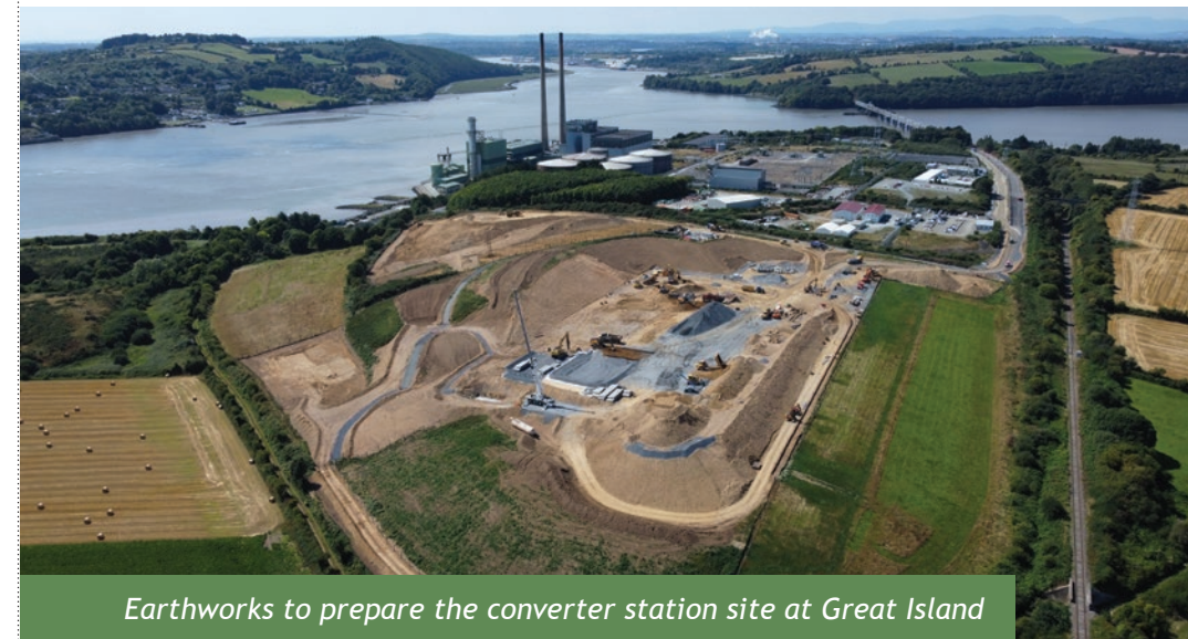
Earthworks to prepare the converter station site at Great Island

Welcome to the latest edition of our community newsletter, keeping local people updated on the Greenlink electricity interconnector, one of Europe's most important energy infrastructure projects.